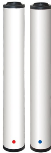
High Performance Elements inside